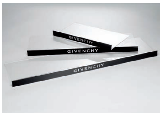
Givenchy POPAI Winner - Shelf Dresser