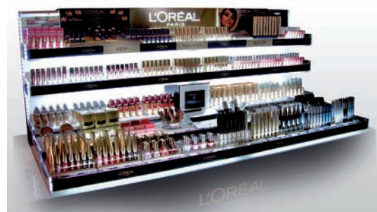
Bergerie Cosmetic Table Unit