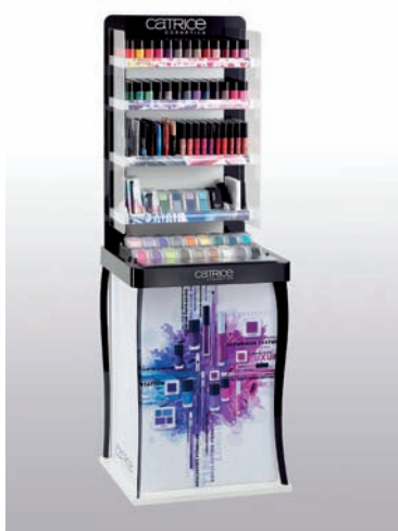
Catrice POPAI Winner - Floor Stand

GESAs services the Luxury market, Mass market as well as Flagship / Concept stores