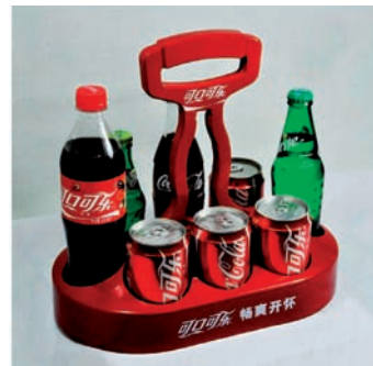
Mass market - Asia FMCG, foldable Drinks Carrier & Straw Dispenser, by GESA Shanghai

Merchandising Service: If required by customers, GESA also offers a customized merchandising service.