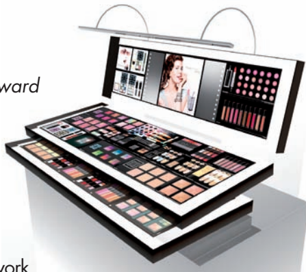
3D design image for Award Winning Display

Design: A team of 12 international display designers, interpret the brief and bring to life exciting solution options with focus on branding and ergonomics.