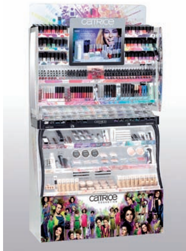
Catrice POPAI Winner - Beauty Shop

GESA continually strives to push out the boundaries of innovation & design. The POPAI awards (the Oscars of the display world) recognize excellence in point of purchase display. The dynamic & creative teamwork between GESAs & its