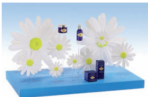
L'Occitane POPAI Winner - Window Display