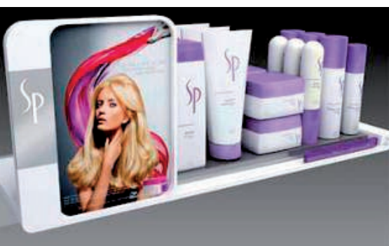
Premium Shelf Display

GESA has full design service and production facilities in China/ Shanghai as well as active on the ground specialist teams based in Paris and London.